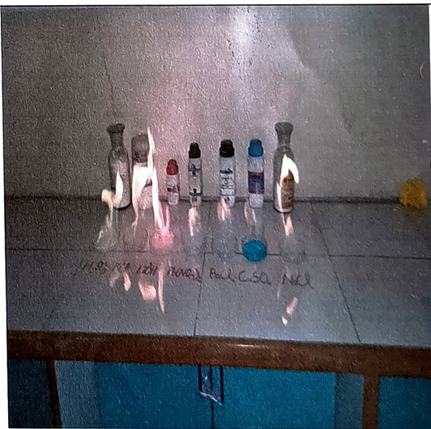
Rainbow of Fire Experiment by First Year Chemistry Students