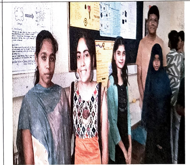
Student Participation during the event