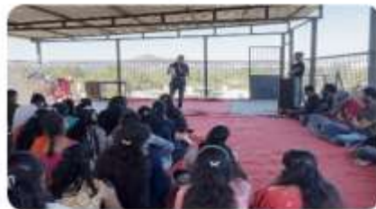
Guest Lecture on Sports