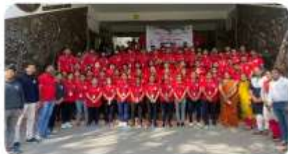
Volunteer's Ready for Camp