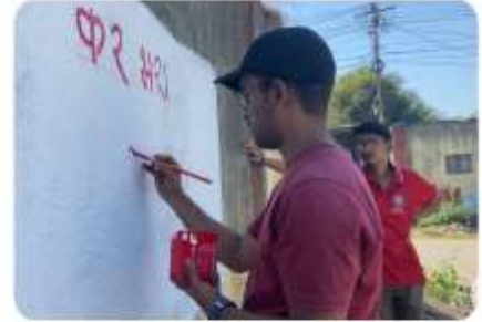
Made Signs and Awareness