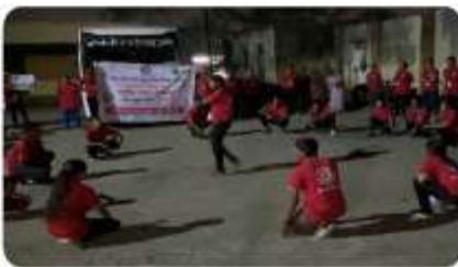
Street Play Presentation