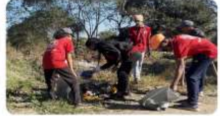
Cleaning Village Roads