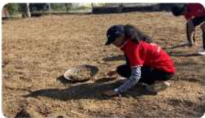
Finalizing Kabaddi Ground