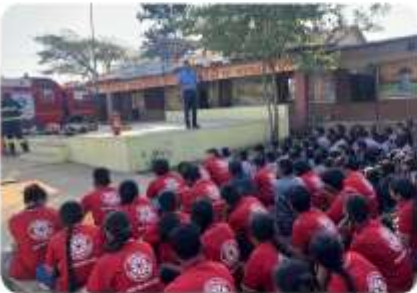
Guest Lecture on Emergency