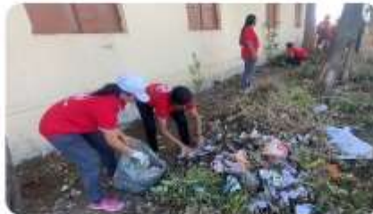
Cleaning School Backside