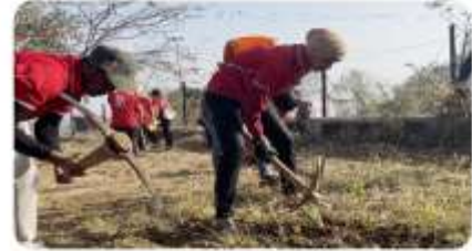
Making Kabaddi ground