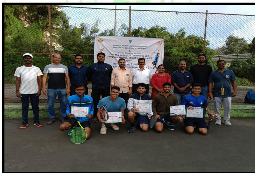
Inter Collegiate Lawn Tennis men & women Competition Organization