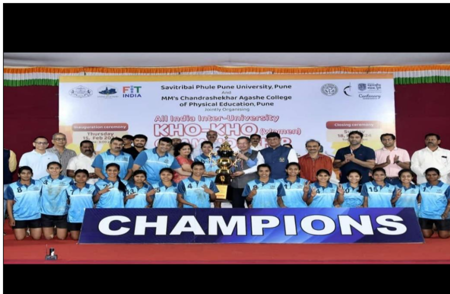
All India Inter University Kho Kho women Team – Gold Medal