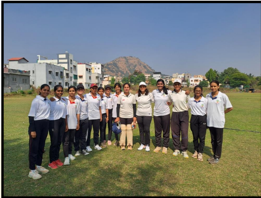
Inter Collegiate Cricket Women Runner Team

RECOGNIZED BY GOVERNMENT OF MAHARASHTRA AFFILIATED TO SAVITRIBAI PHULE PUNE UNIVERSITY *UNIVERSITY COLLEGE CODE: 0826 * REG. NO. PU/PN/BBA, BCA, BFT/280/2007 NAAC "A" GRADE WITH 3.22 CGPA ACCREDITED EDUCATIONAL INSTITUTE IN PCMC AREA