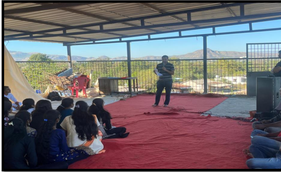
15 th Jan 2024 MH State Sports Day lecture

RECOGNIZED BY GOVERNMENT OF MAHARASHTRA AFFILIATED TO SAVITRIBAI PHULE PUNE UNIVERSITY *UNIVERSITY COLLEGE CODE: 0826 * REG. NO. PU/PN/BBA, BCA, BFT/280/2007 NAAC "A" GRADE WITH 3.22 CGPA ACCREDITED EDUCATIONAL INSTITUTE IN PCMC AREA