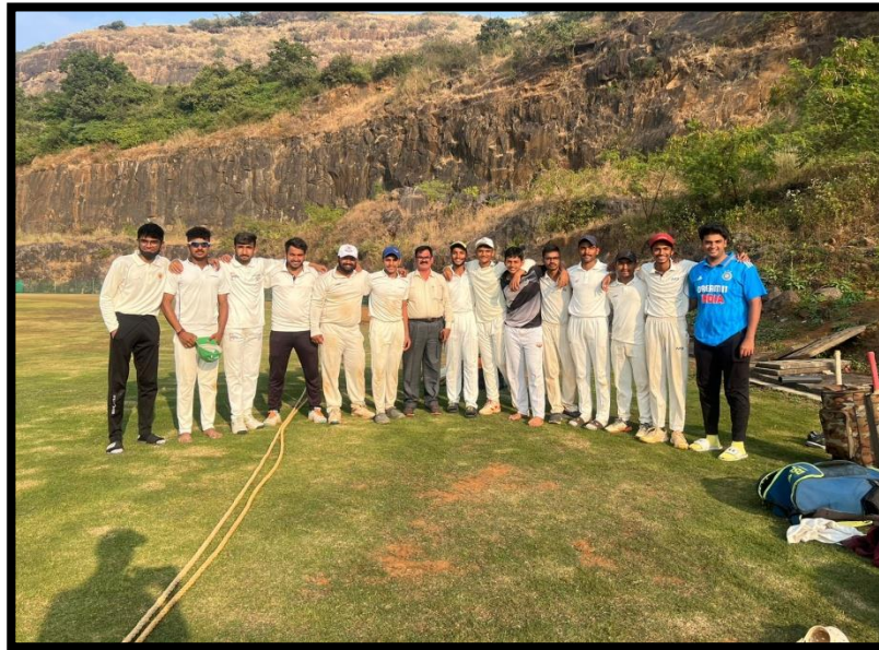
Inter Collegiate Cricket Men Team

RECOGNIZED BY GOVERNMENT OF MAHARASHTRA AFFILIATED TO SAVITRIBAI PHULE PUNE UNIVERSITY *UNIVERSITY COLLEGE CODE: 0826 * REG. NO. PU/PN/BBA, BCA, BFT/280/2007 NAAC "A" GRADE WITH 3.22 CGPA ACCREDITED EDUCATIONAL INSTITUTE IN PCMC AREA