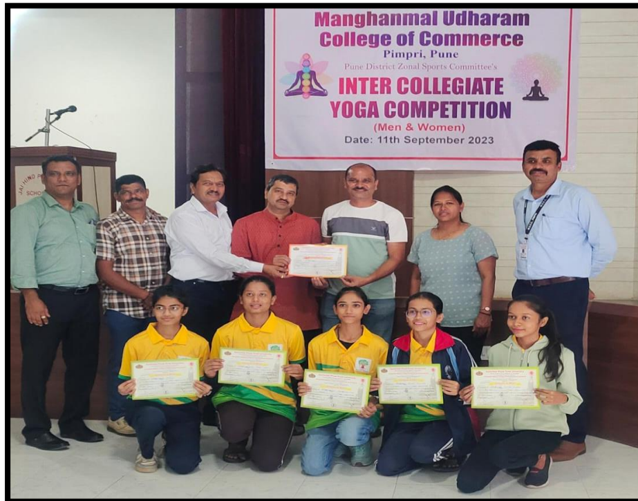
Inter Collegiate Yoga Women –Winner Team