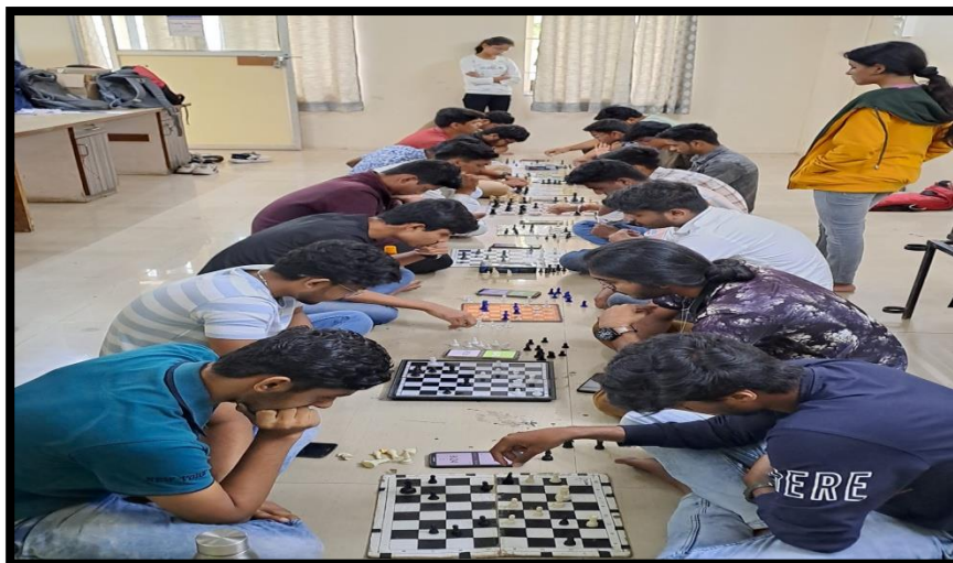
National Sports Day (29 th August, 2023) Competition