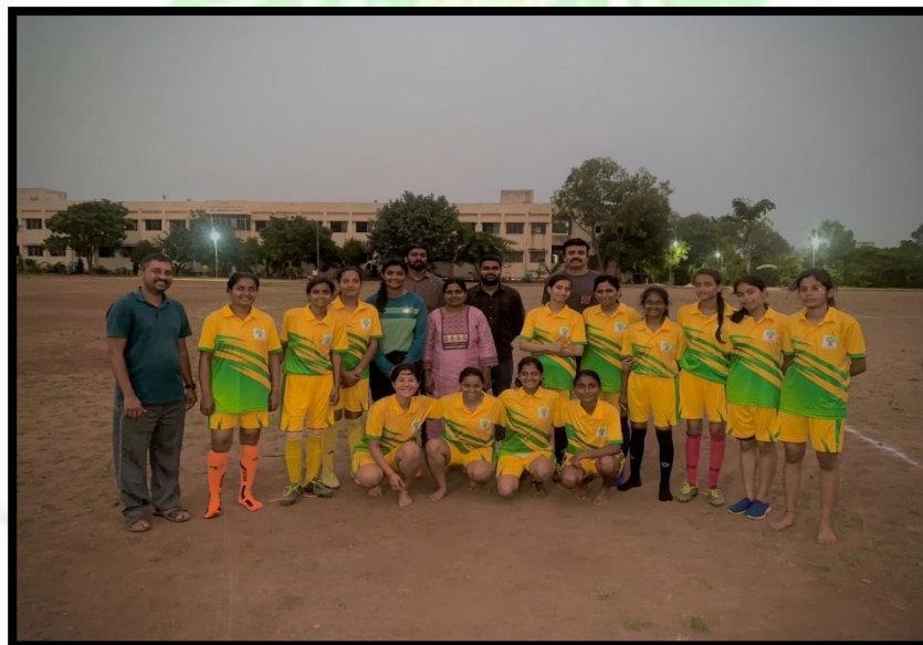
Inter Collegiate Football Women Runner Team