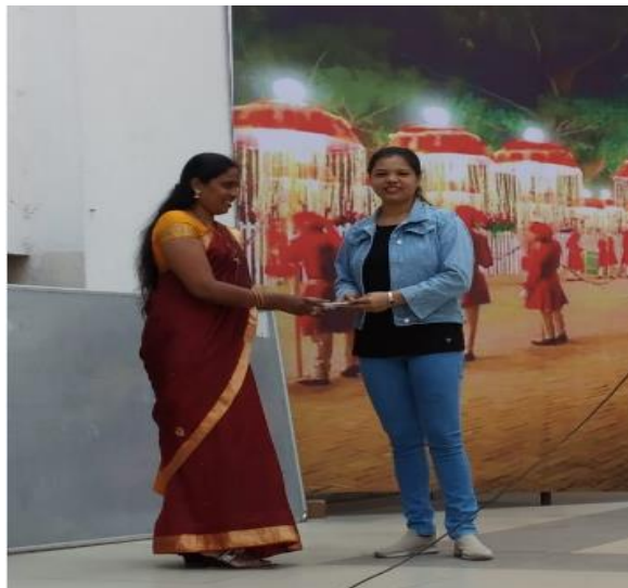
Felicitation of Judge