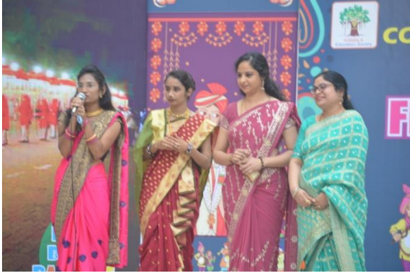
Felicitation of judge