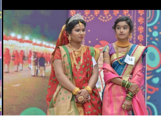
s Student's Performance