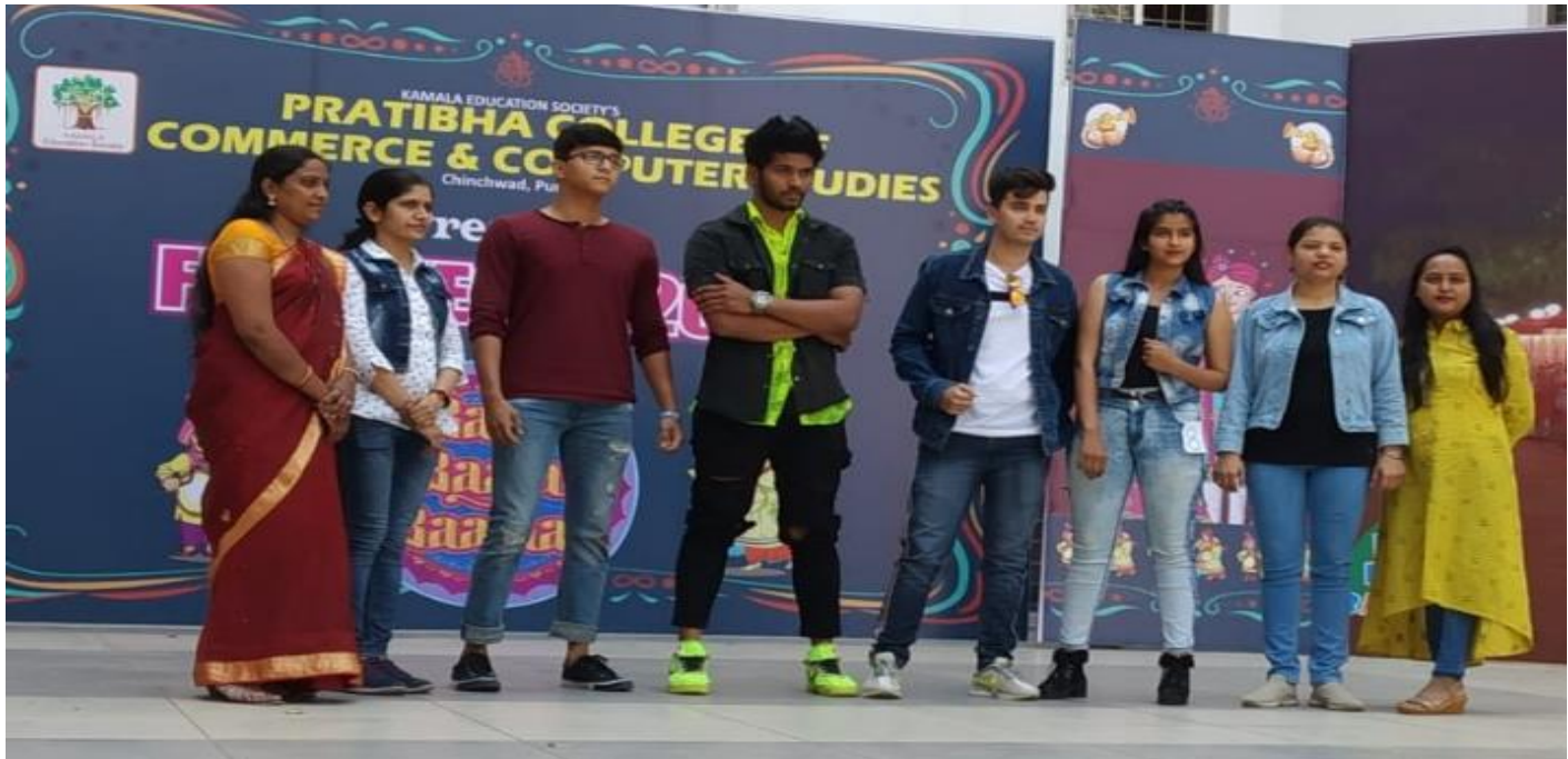
Winners of the Denim Day along with Judges